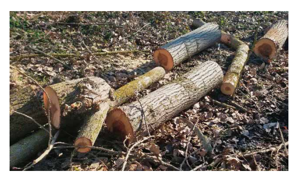
Figure 1 Harvesting and debarking Poplar tree Slika 1. Sječa, izrada i otkoravanje drva topole