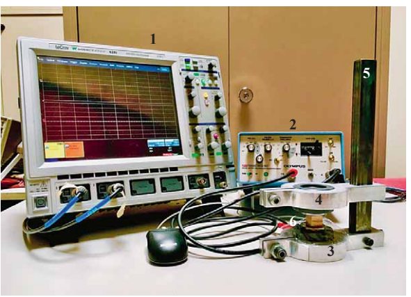
Figure 4 Ultrasonic equipment: 1. oscilloscope, 2. pulser-receiver, 3. transducer sender, 4. transducer receiver, 5. auxiliary testing device, 6. sample Slika 4. Oprema za ultrazvučna mjerenja: 1. osciloskop, 2.

Homogenized material properties of micro-heterogeneous materials are defined on representative vol-