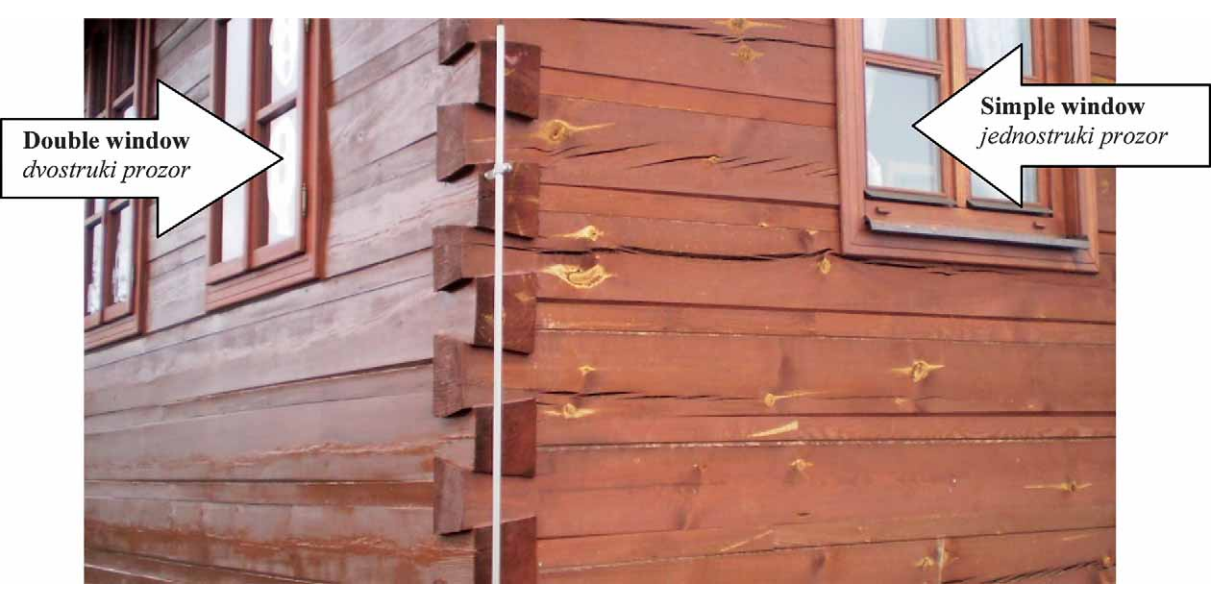
Figure 1 A view of simple and double windows from the exterior Slika 1. Pogled na jednostruki i dvostruki prozor s vanjske strane