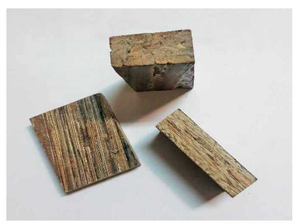
Figure 3 Examples of test specimens from date palm rachis-based LSL blocks Slika 3. Primjeri ispitnih uzoraka LSL blokova od lisnih osi palme datulje

tion to the response (Phadke, 1989; Ross, 1996). ANOVA analysis is also needed for estimating the variance of error for the effects and confidence interval of the prediction error. This analysis is performed on S/N ratio to obtain the percentage contribution of each factor (Gaitonde et al. , 2007).