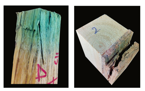
Figure 4 Fracture modes for test specimens: Compression strength parallel to grain (left), shear strength parallel to grain (right)

The highest specific compression strength parallel to grain value was obtained in treatment No. 6 as 61.80 N/mm<sup>2</sup>, which is lower than that of LVL, PSL, and LSL from poplar wood, being 102 %, 61 %, and 36 %, respectively. It may be due to lower maximum crushing strength of date palm rachis strand than that of solid wood strand, and penetration of resin into more porous structure of date palm rachis than that of solid wood. On the other hand, the structure of samples and