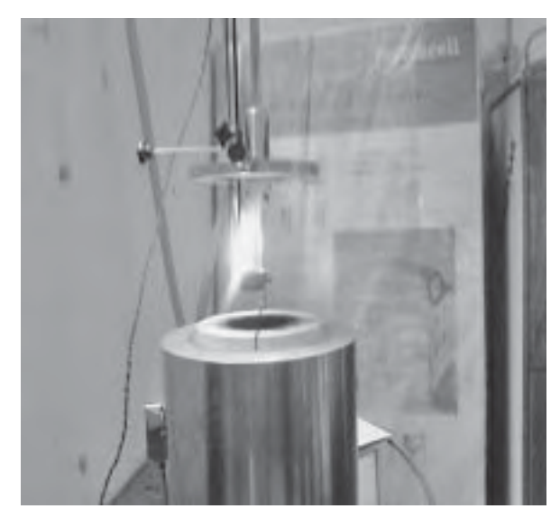
Figure 1 Photo of the apparatus for STN ISO 871 Slika 1. Uređaj za STN ISO 871

Testing apparatus schematically illustrated in Figure 2 is used for model burning tests. This apparatus