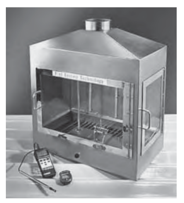
Figure 3 Combustion chamber according to the STN EN 11925-2

The burner is lighted in the vertical position to stabilize the flame. A flame height of 20 mm is adjusted